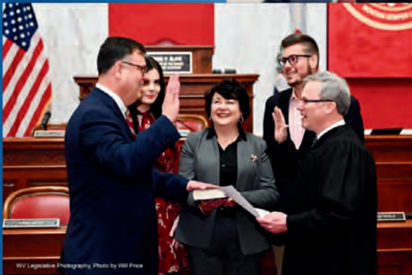
WV Legislative Photography. Photo by Will Price